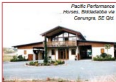
Pacific Performance Horses, Biddadabba via Canungra, SE QLD.