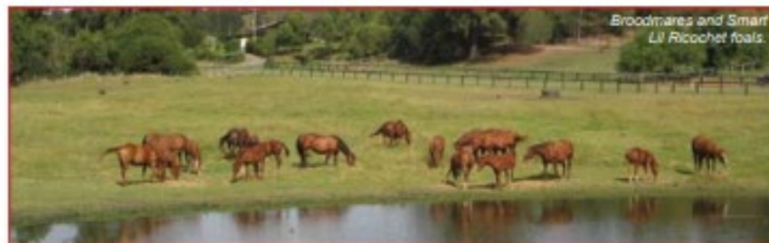
Broodmares and Smart Lil Ricochet foals.